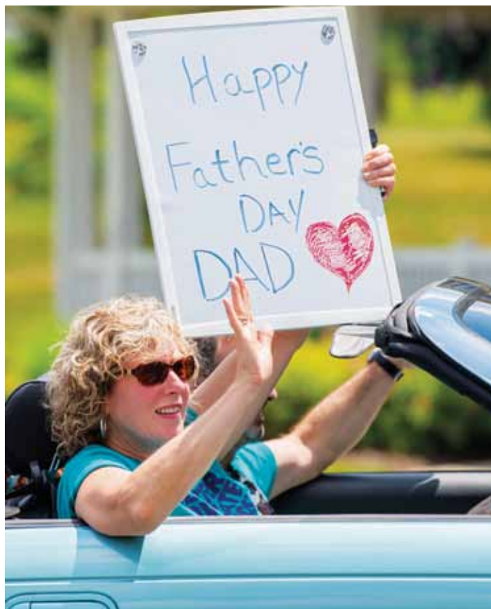
Danbury Senior Living held a drive thru Classic Car Show on June 20th for their residents to watch from their patios and balconies. Many drivers held up Happy Father's Day signs to their dads that are residents. See more photos on page 2.

Parma having trouble finding 5G provider. P 8